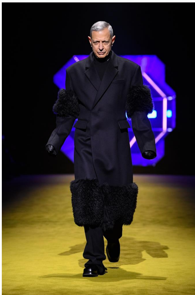
Jeff Goldblum giving us classic villain vibes